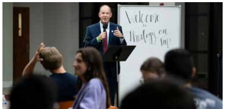
Theology on Tap