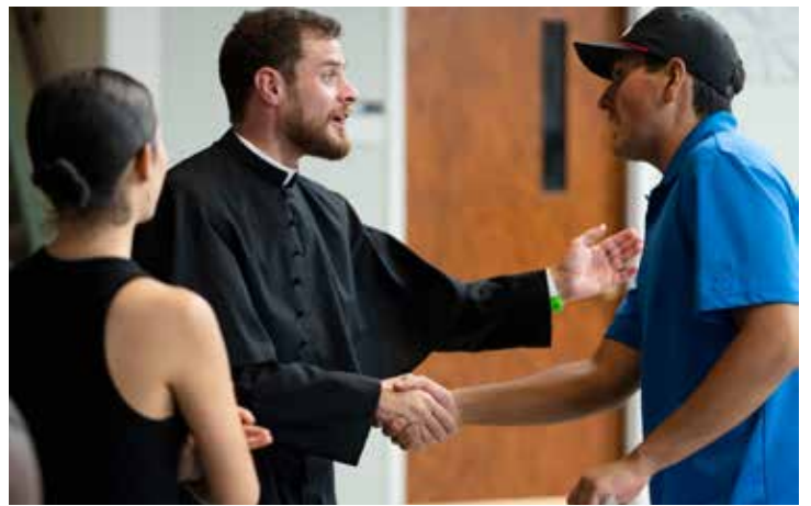
Theology on Tap