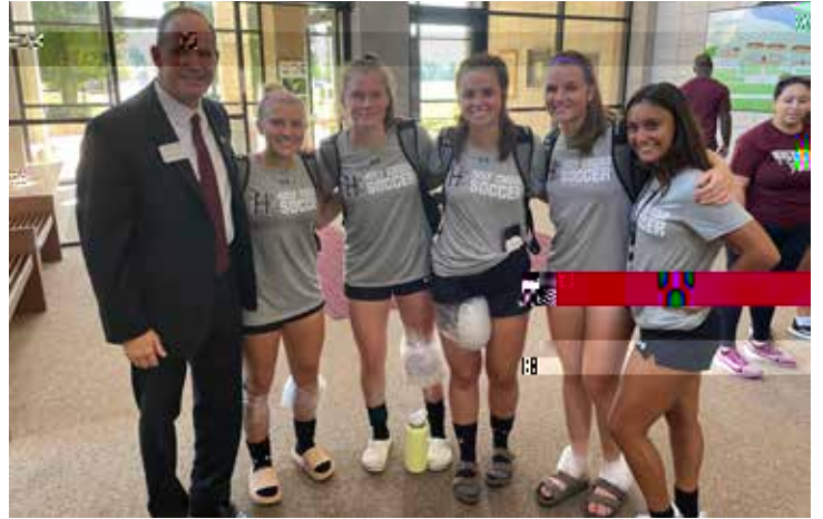
Welcome Weekend 2022