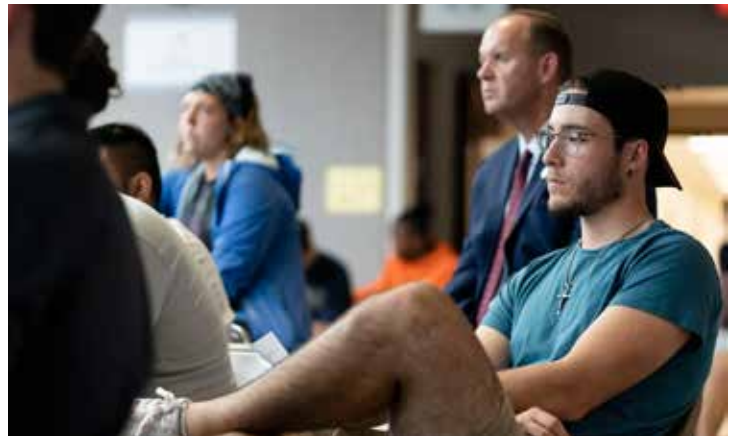
Theology on Tap