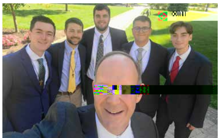
Final profession of vows